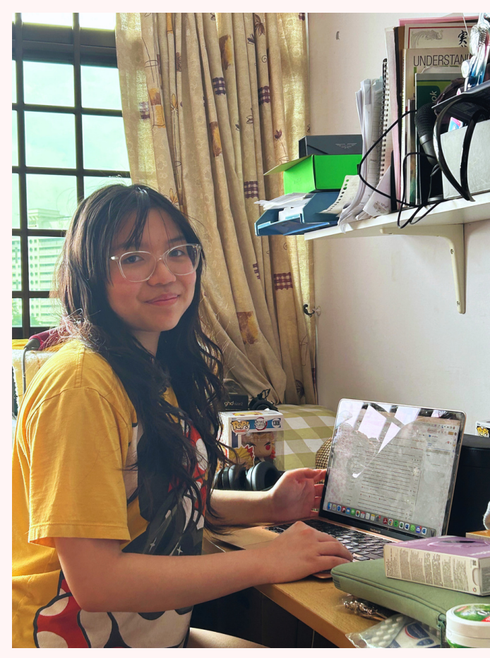
Working remotely from home at Agents of Discovery

I worked multiple roles during my time at Agents of Discovery. I started off as a Graphic Designer, then I moved on to being an HR Assistant. And finally, I was a part of Sales & Partnerships. I was jumping between the different departments within the organization. I enjoyed developing new skills, gaining a variety of experiences, and working within different departments all while working for the same organization.