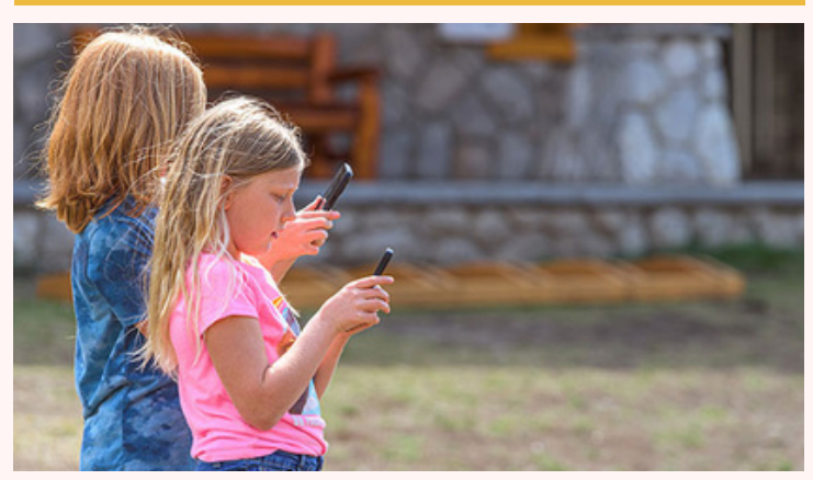
Children playing Agents of Discovery at the Big White Ski Resort, Kelowna https://www.bigwhite.com