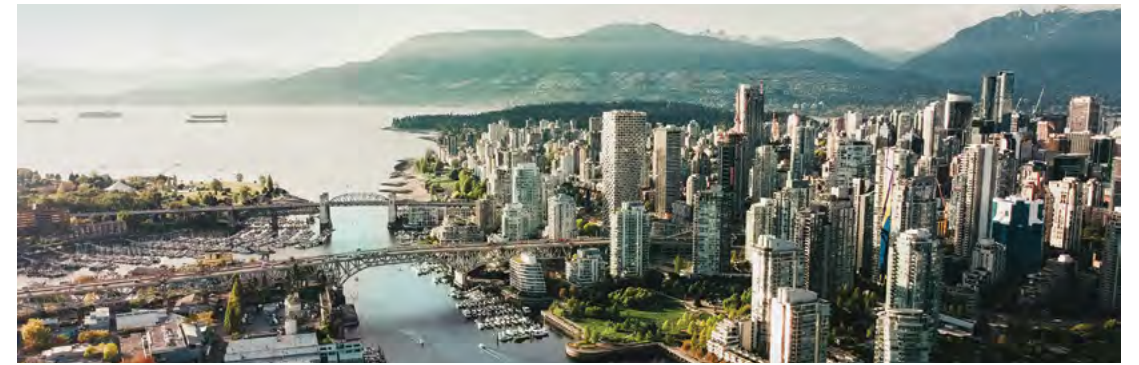
Above: Vancouver city skyline