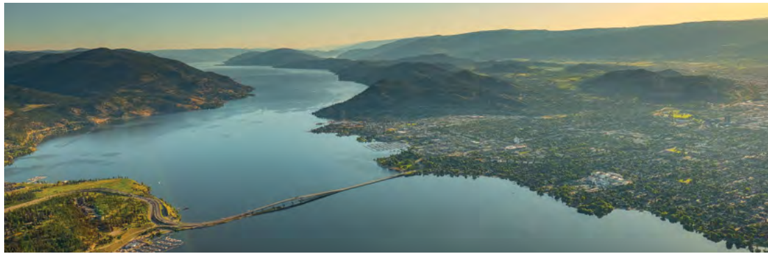
Above: Okanagan Valley