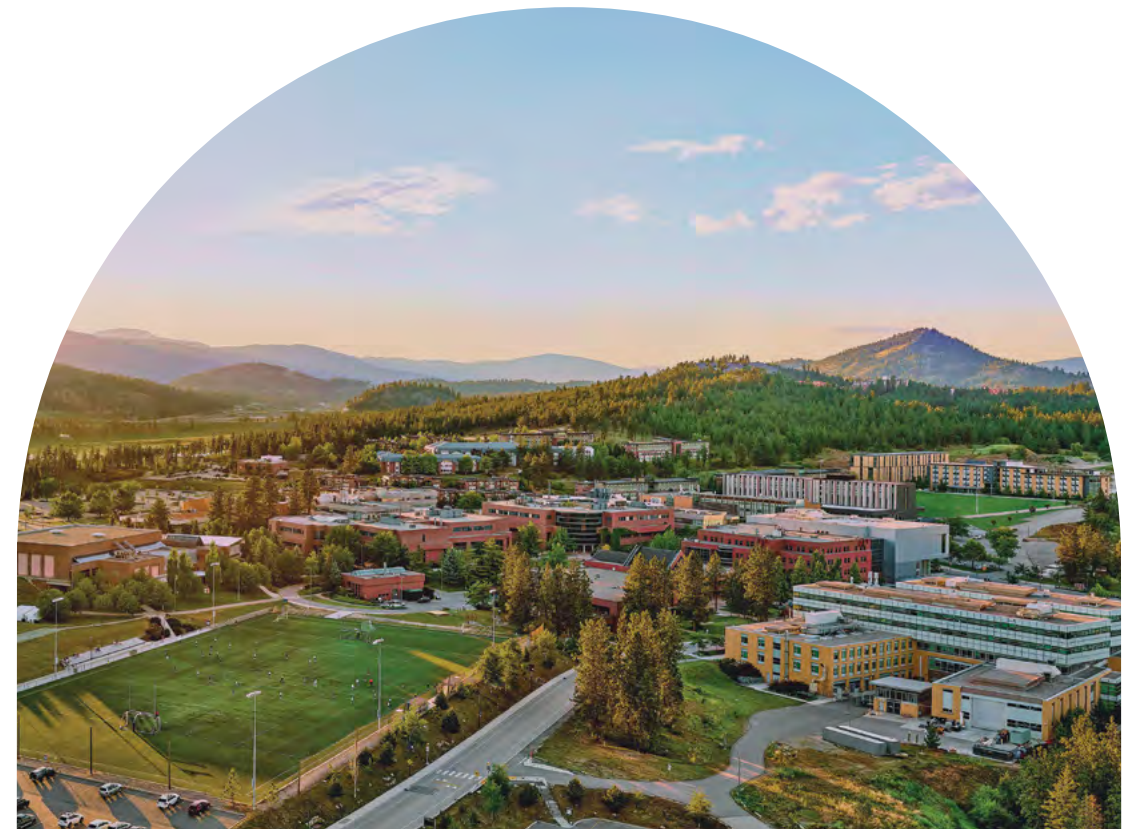
Below: Okanagan campus