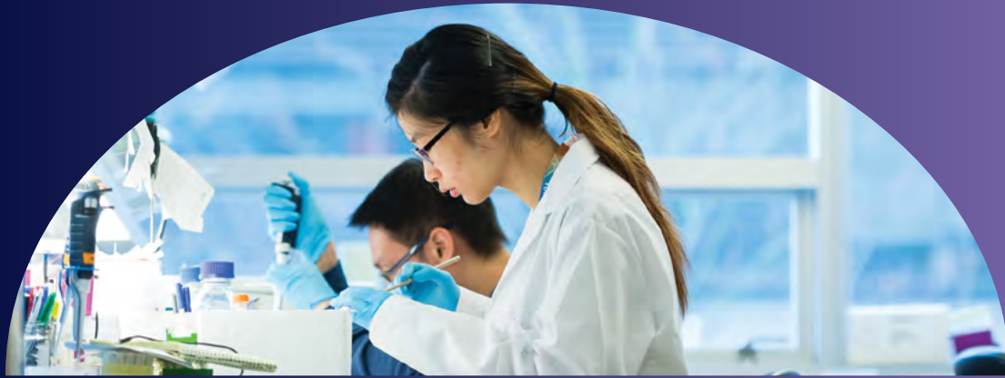
Student research at the UBC Prostate Centre.

With degrees in every major field of study, plus opportunities for specialization and co-op learning, there's no limit to what you can study during your time at UBC.