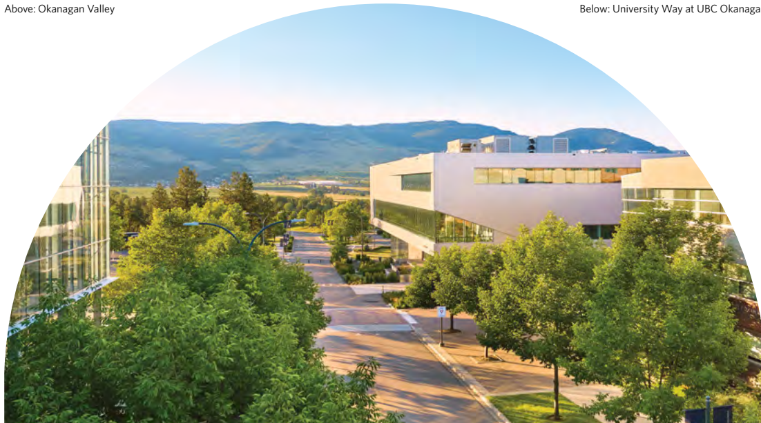
Below: University Way at UBC Okanagan