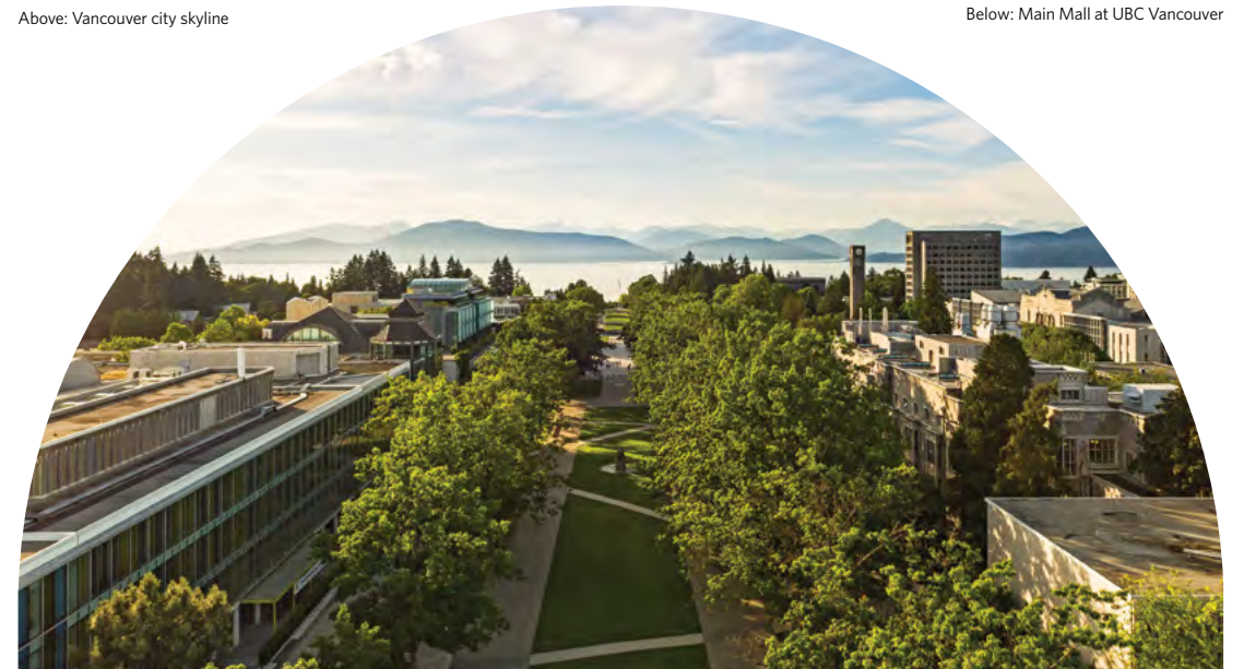
Below: Main Mall at UBC Vancouver

"I consider the UBC Vancouver campus another home to me because it is a place where I have found community and lifelong friendship. My experiences here have strengthened my desire to use my degree to connect with community and advocate for Indigenous representation in health and physical activity spaces."