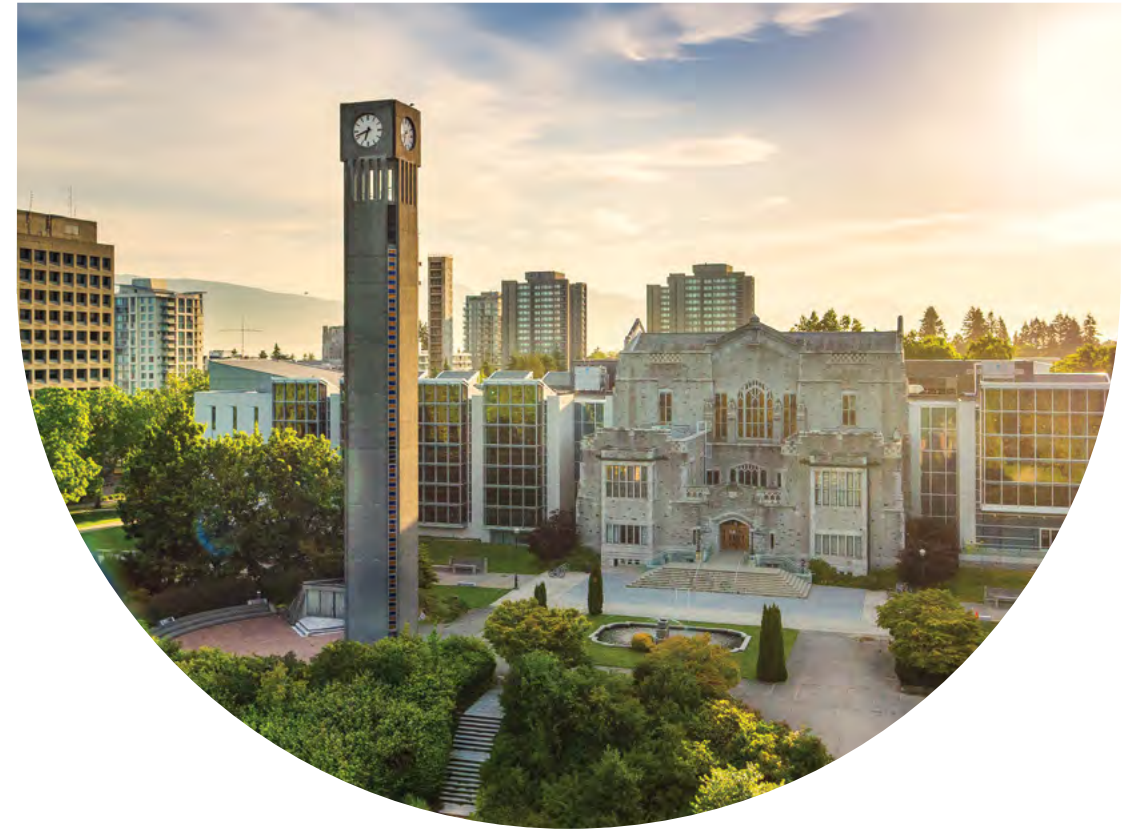
Above: Vancouver campus